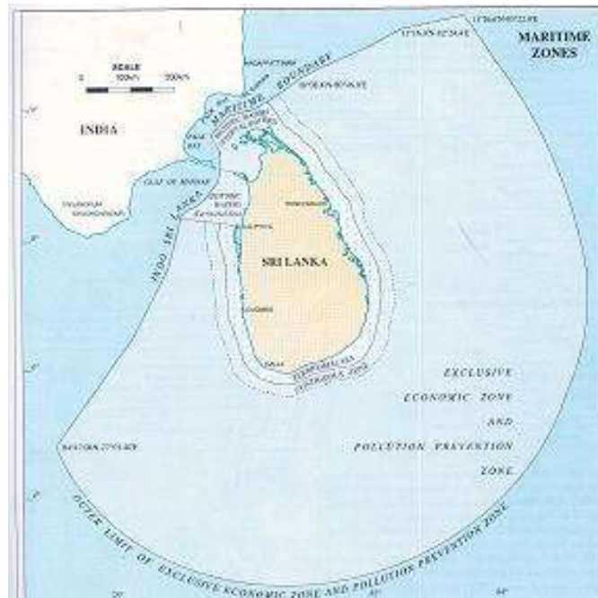
Figure 1: EEZ, Indo – Sri Lanka Maritime Boundary and the Historic Waters

The fisheries sector plays an indispensable role in the economy of Sri Lanka contributing around 1.2% to the GDP. Fish products are an important source of animal protein, providing around 70% of the animal protein consumed in the country (Food Balance Sheet, Department of Census and Statistics). The sector provides direct and indirect employment to around 650,000 people and is directly linked with the lives of approximately 50% of the population who resides in the coastal belt. Fisheries sector contribution to the total export earnings of the country is around 2.5%. The fisheries sector has a significant scope for increasing the contribution to the national economy, exploiting the huge untapped potential 8 .