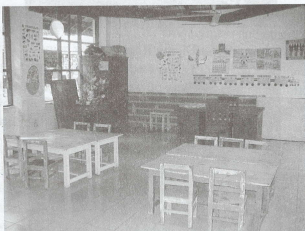
A Class Room