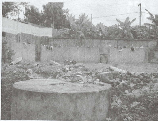
This is not a garbage dump but an exercise yard